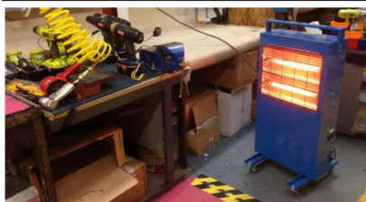
Ideal for a host of industrial applications