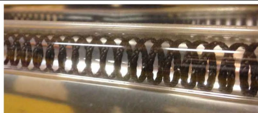
New carbon fibre filaments offers unrivalled strength...