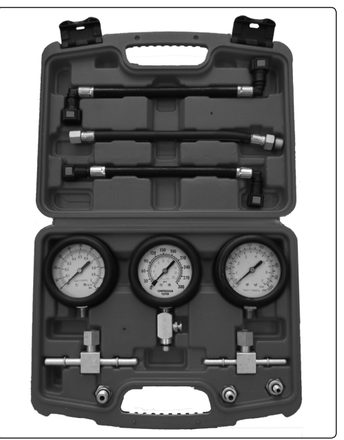
MS100 Issue 2 (P) - 17/07/13