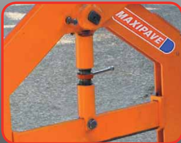
Large Thread, Single Screw Adjuster