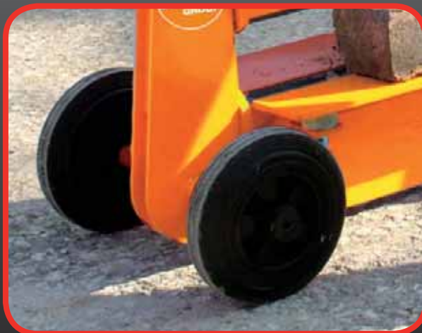
Heavy Duty Wheels for Site Usage