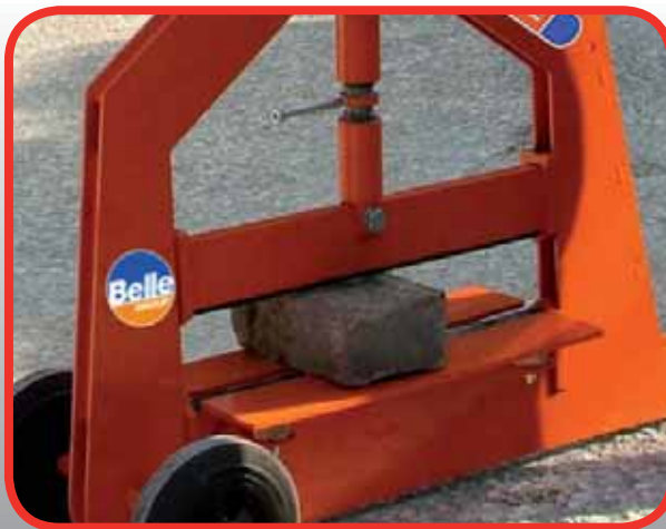
Heavy Duty Blades