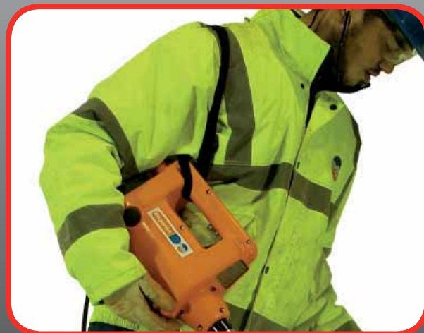
Carry Strap for Easy Handling