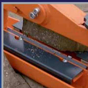
Heavy Duty Blades For Accurate Cutting