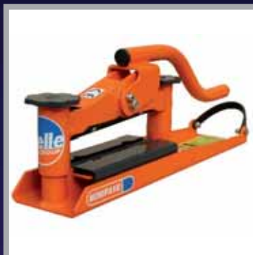
Compact Design For Working At Floor Level