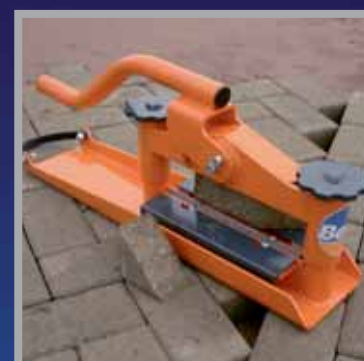
Ideal For DIY Block Paving