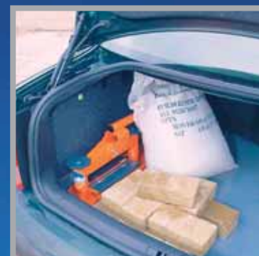
Fits Into The Back Of Any Car With Ease