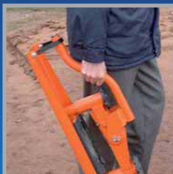
Easily Transportable Around Site