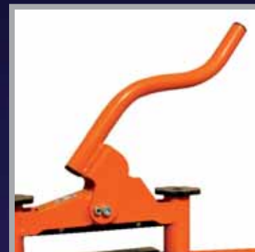
Heavy Duty Handle For Easy Cutting