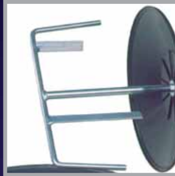
Effective Paddle Design