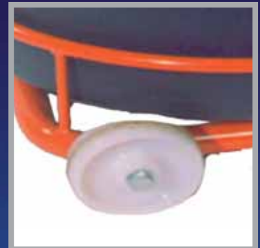
Wheels For Easy Transportation