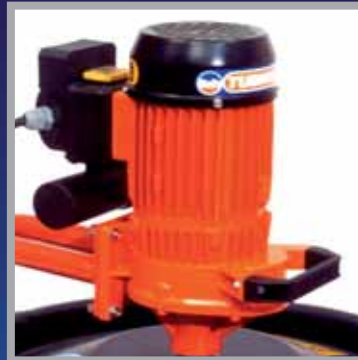
Maintenance Free Motor