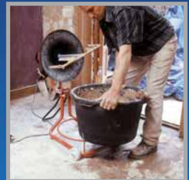
Easily Manageable Tub