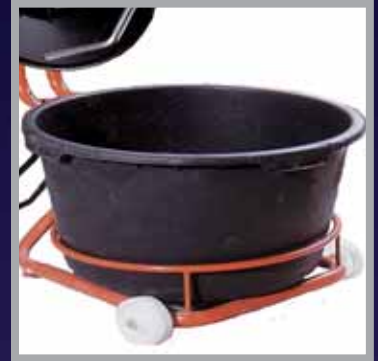
Large Flexible Drum